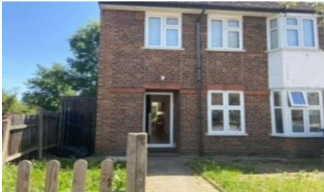
Front of house