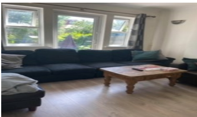
living room 2