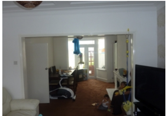
Living room 2