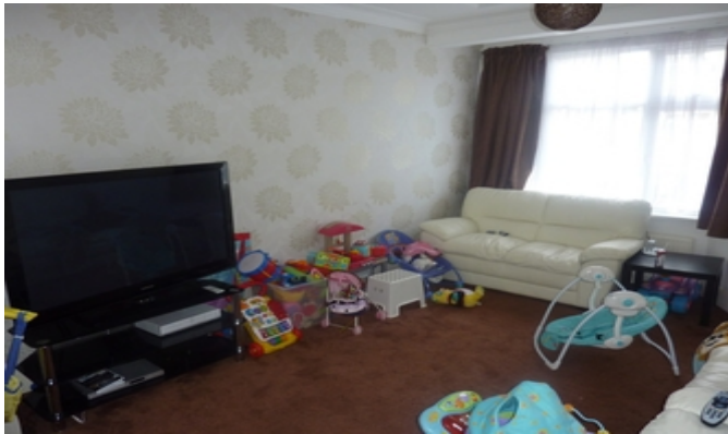
Living room 1