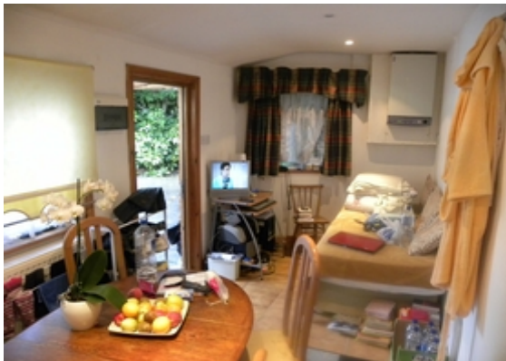
Open plan lounge