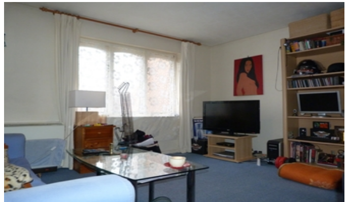
Good Size Living Room