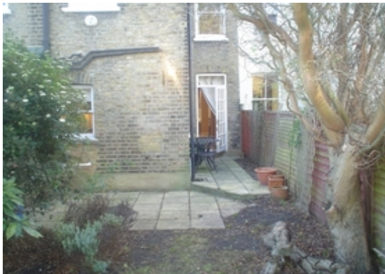
Garden, second aspect