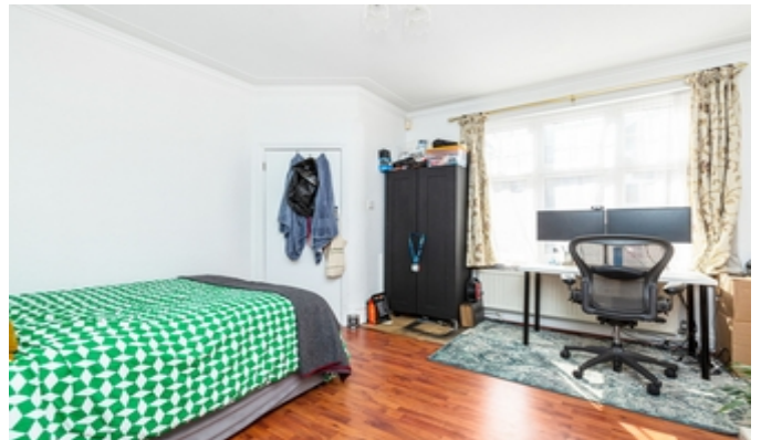
Reception 2 angle 2