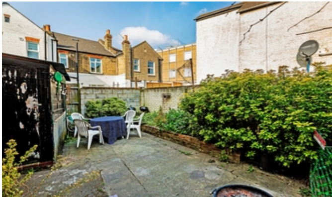
Garden angle 2