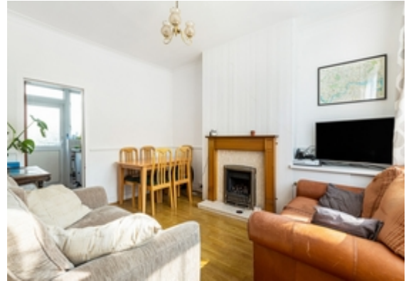
Reception 1 angle 2