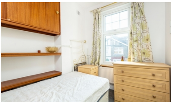
Bedroom 3 - angle 2