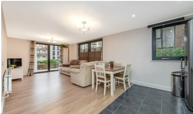
Living Area 2