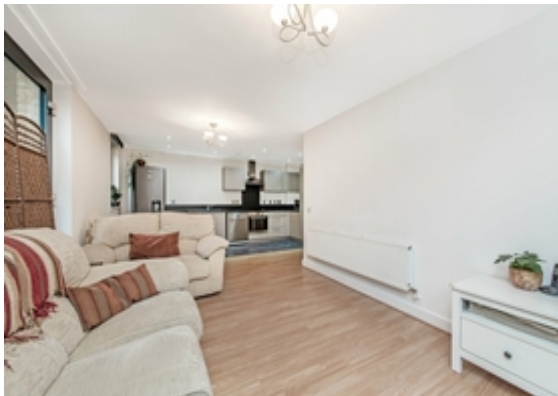
Open Plan Kitchen / Living Area