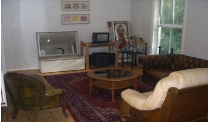
Hasnard Mews Living Rm