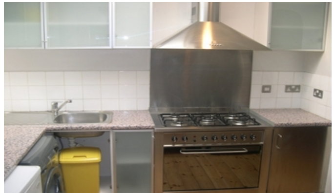
Hasnard Mews Kitchen