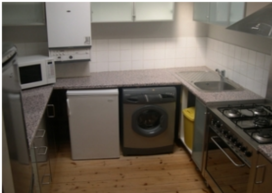
Hasnard Mews Kitchen