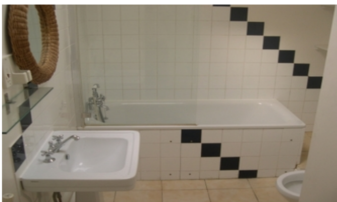
Hasnard Mews Bathroom