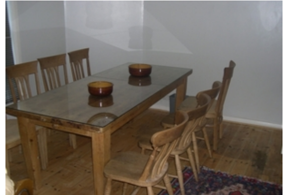
Hasnard Mews Dining