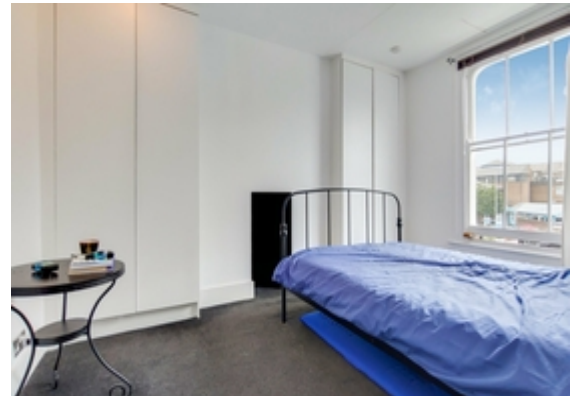
Master Bedroom Alt