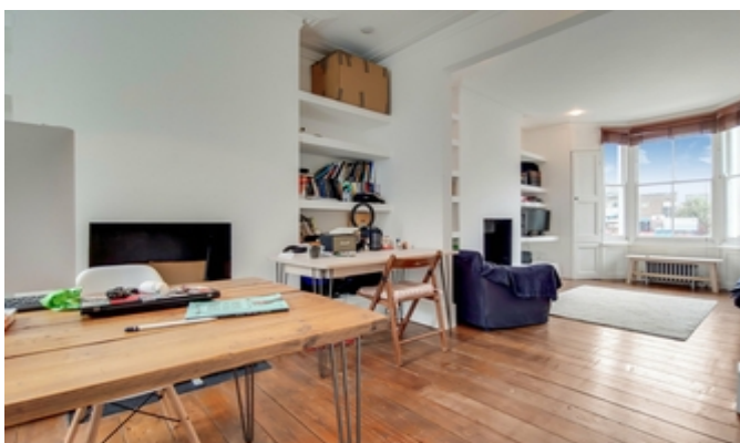
Dining Area Alt