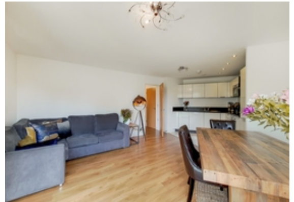
Open Plan Reception Room