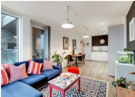
Kitchen and Dining Room