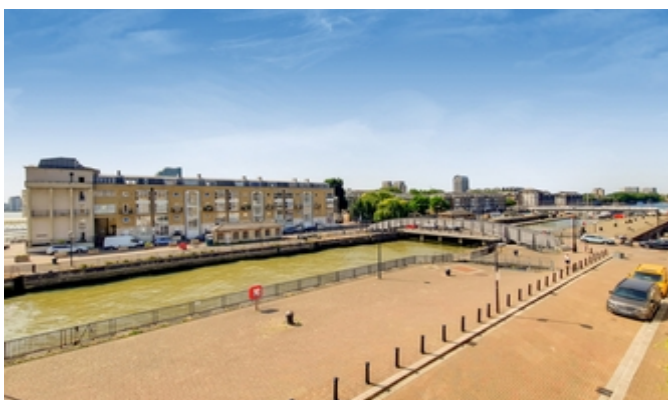
View from front balcony