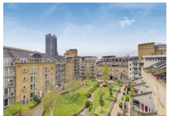
View from Terrace