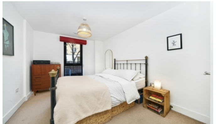
Bedroom 2 alt