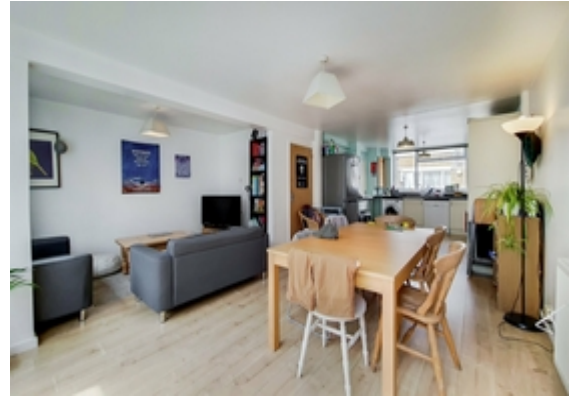
Kitchen / Dining