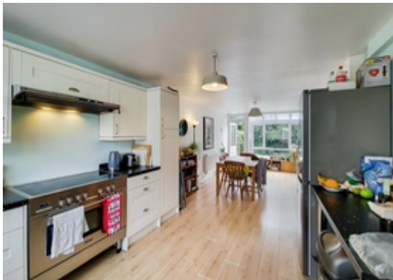
Kitchen / Dining