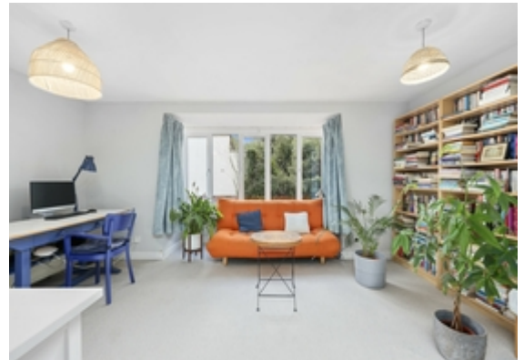
Reception / Kitchen