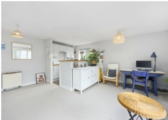
Reception / Kitchen