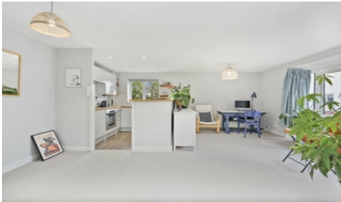
Reception / Kitchen