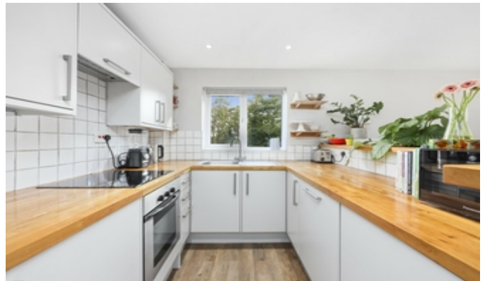
Reception / Kitchen