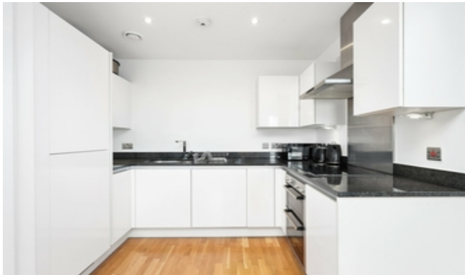
Reception / Kitchen