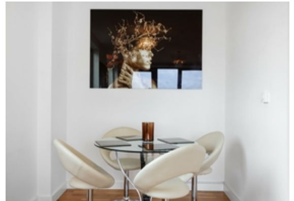
Reception / Kitchen