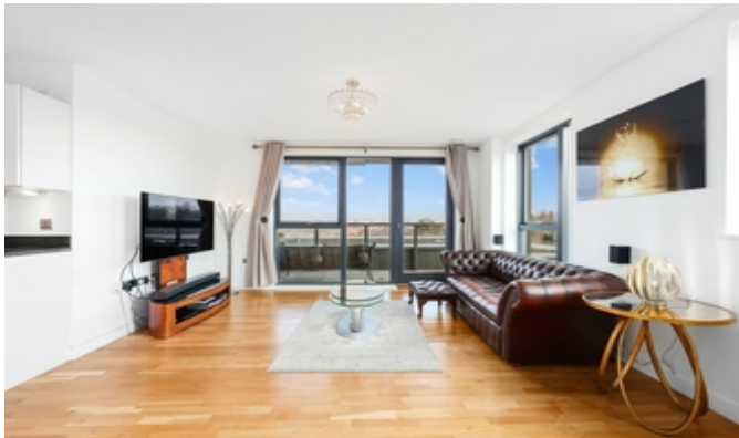
Reception / Kitchen