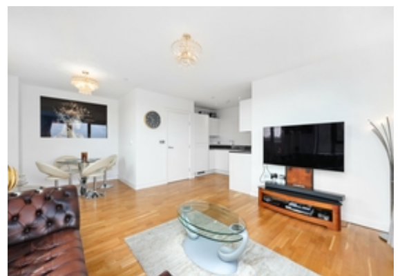
Reception / Kitchen