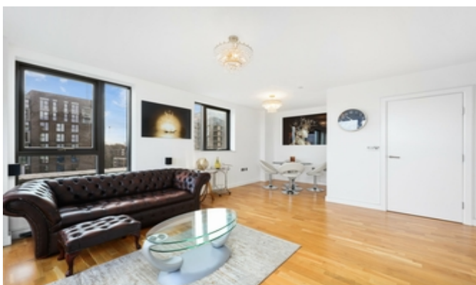
Reception / Kitchen