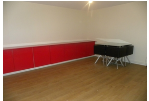
Living Room alt