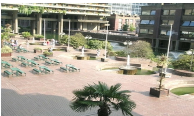
Landscaped communal facilities and gardens