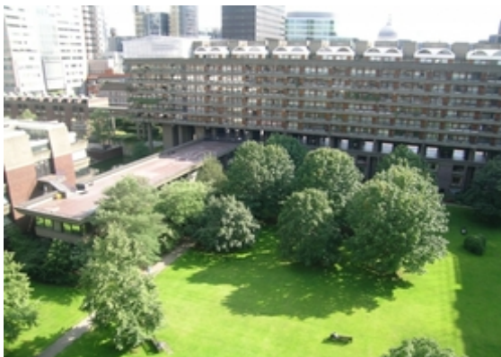
There really are great views