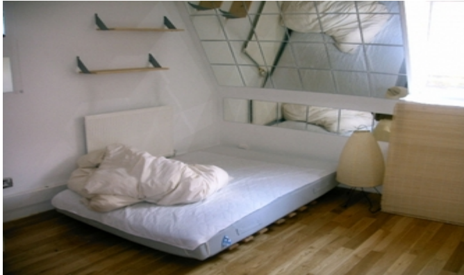
Large double bedroom