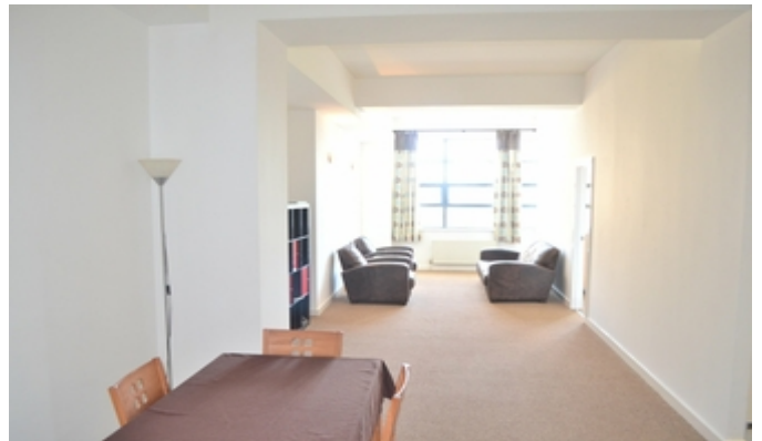
Reception Alt View