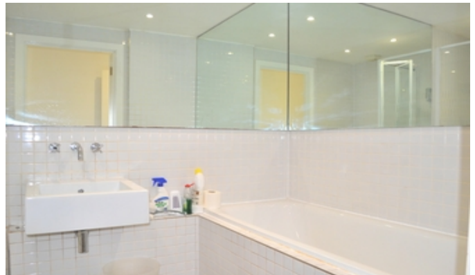
alt view bathroom