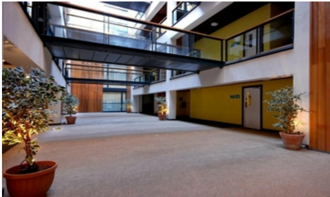
Inside building view