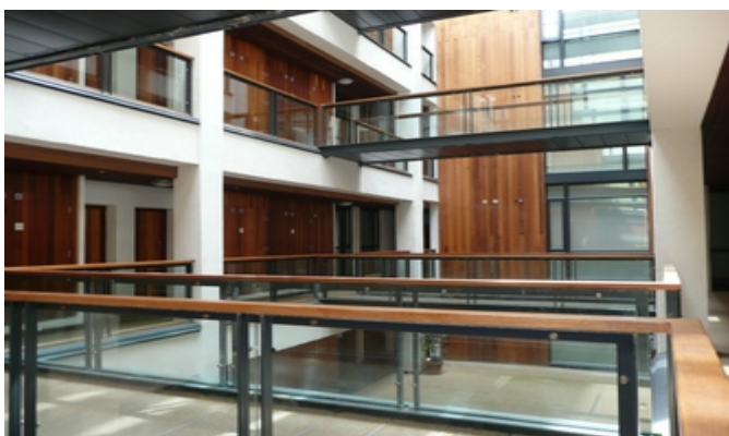
Inside building view 2