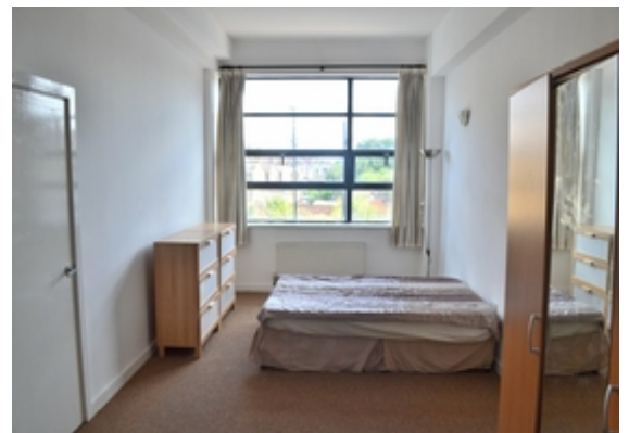
Master Bedroom Alt View