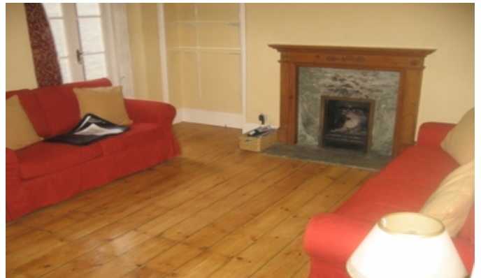
Lounge third aspect