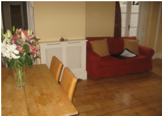
Lounge second aspect