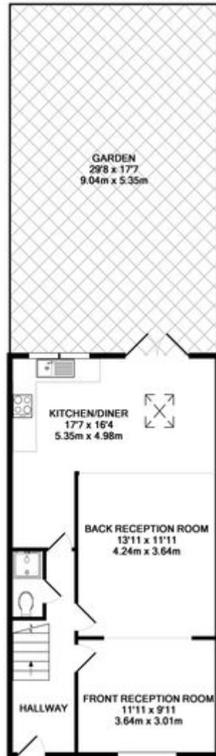
GROUND FLOOR APPROX. FLOOR AREA 591 SQ.FT. (54.9 SQ.M.)