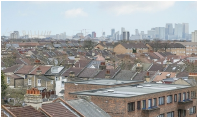
Terrace City View