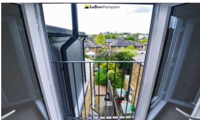
View from master