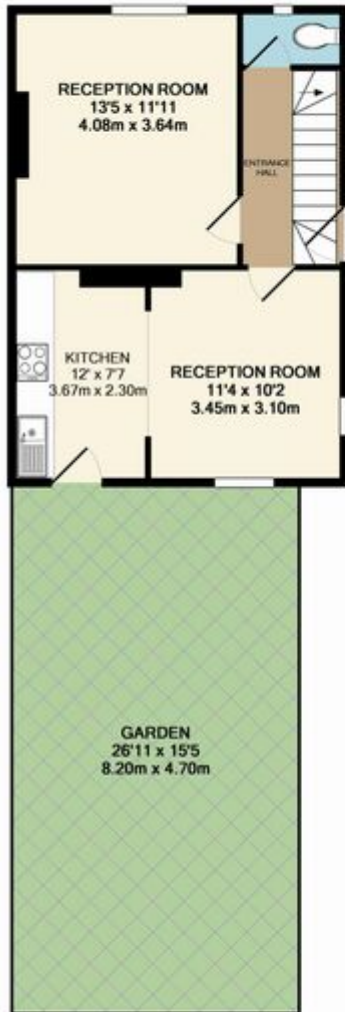
GROUND FLOOR APPROX. FLOOR AREA 423 SQ.FT. (39.3 SQ.M.)