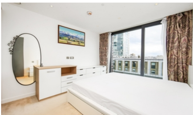
Bedroom aspect 2