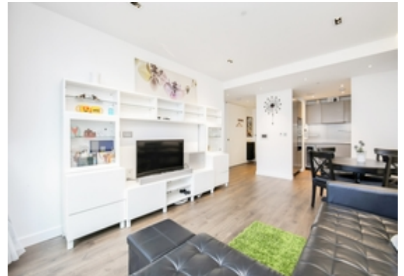
Living room aspect 4