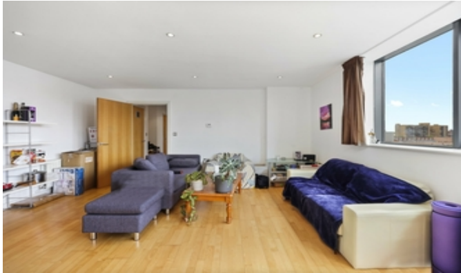
Living Room Alt