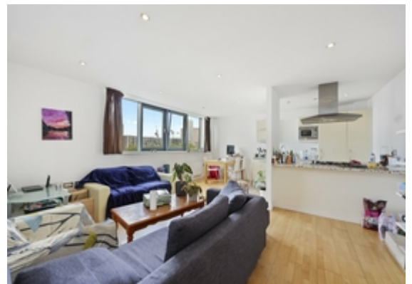
Living Room - Kitchen