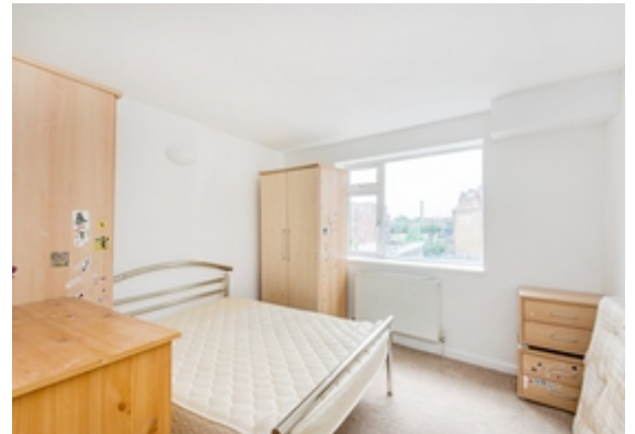
Bedroom Two (Alt)