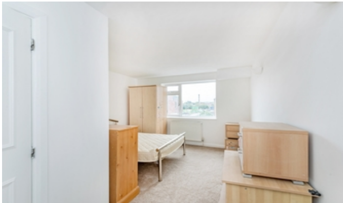
Bedroom Two (Alt 2)