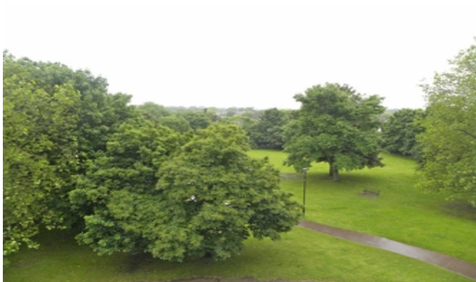
View from reception room