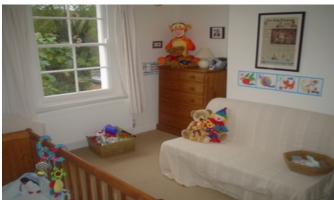
Bedroom Two/Spare Room