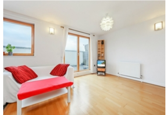
Living Room alt