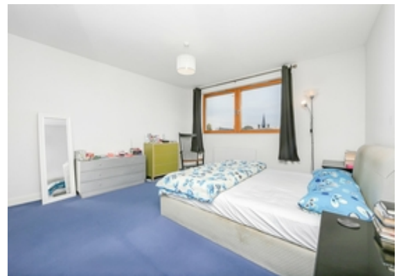
Bedroom 1 alt