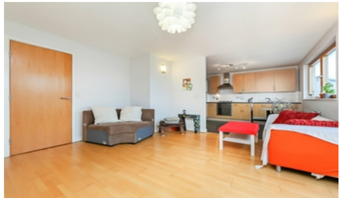
Living Room alt