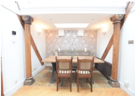
Dining area alt