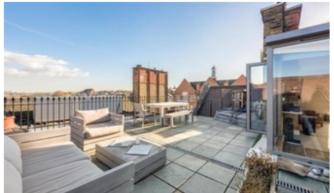
Private Roof Terrace