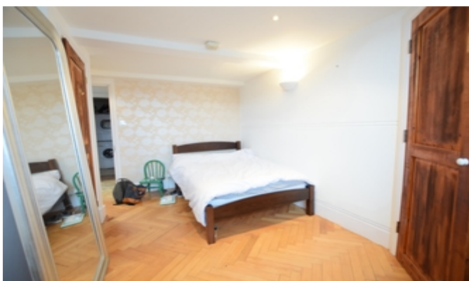
Bedroom 1 alt