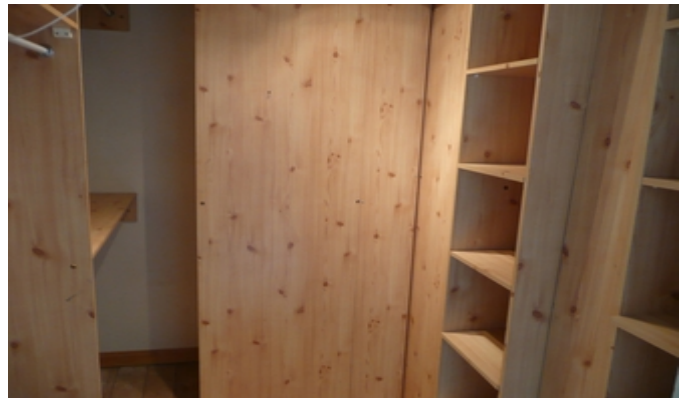
WALK IN WARDROBE