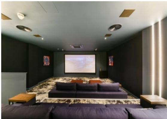
Cinema room aspect