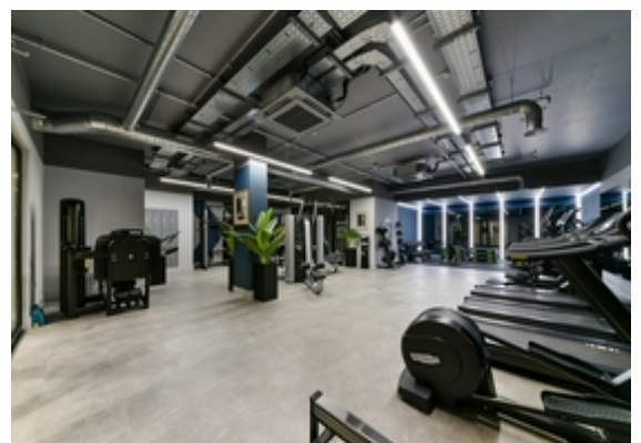
gym aspect 2