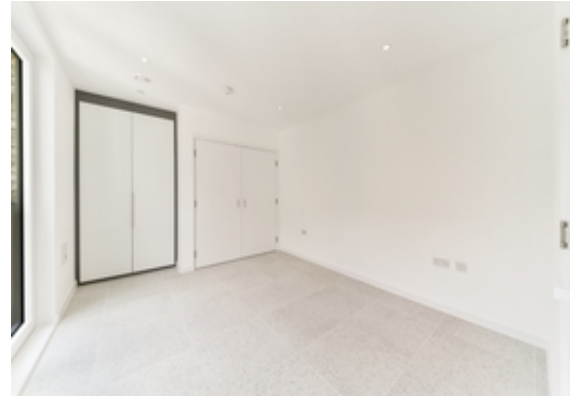
bedroom cupboard aspect