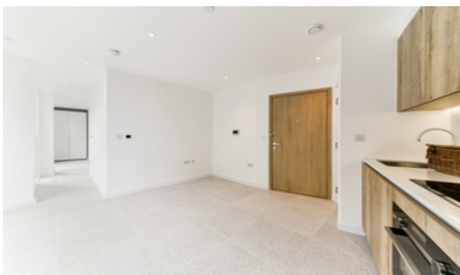
kitchen door aspect