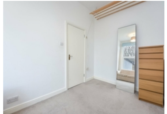
bedroom 2 asp