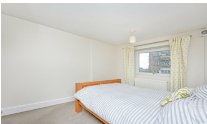
bedroom 1 asp