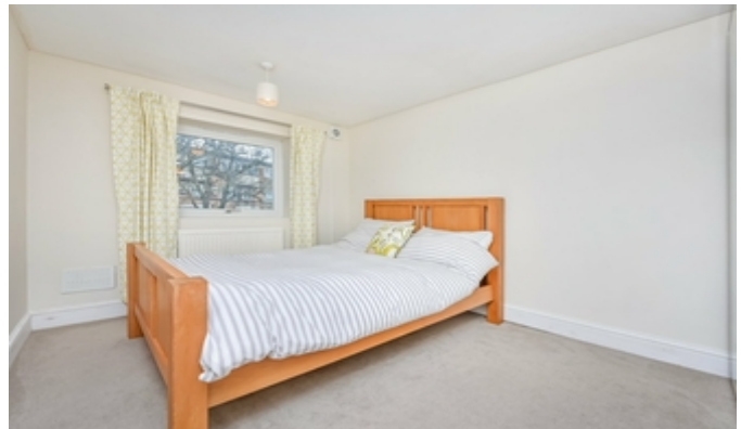
bedroom 1 asp