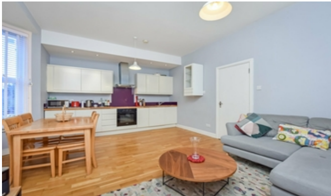
Living room asp