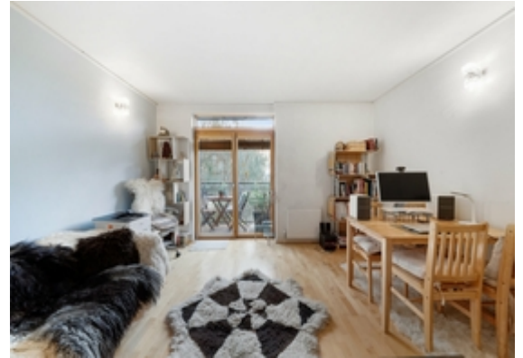
Living Room Alt