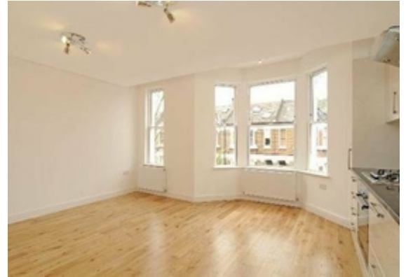
Reception - Sample 2