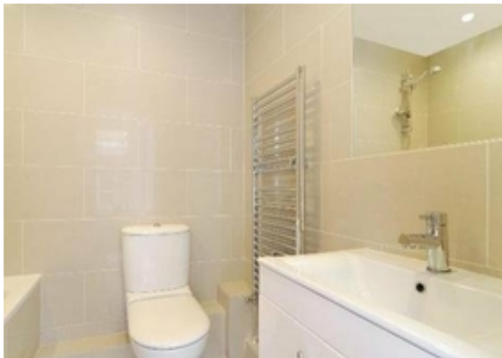
Bathroom - Sample