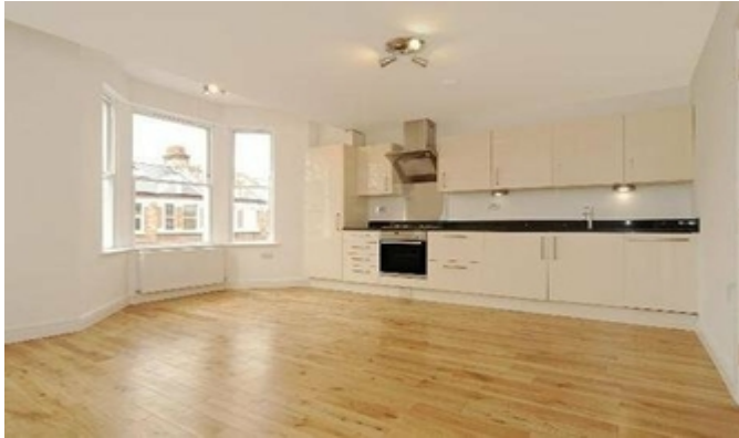
Reception - Sample