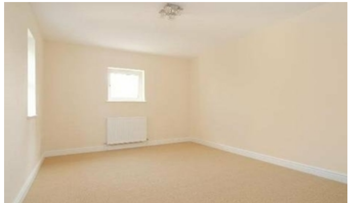
Bedroom - Sample