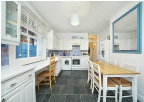
Kitchen / Dining