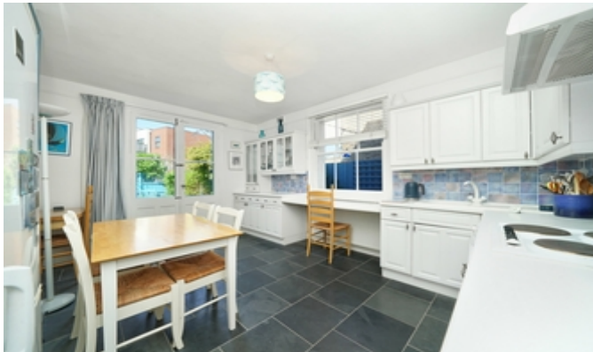
Kitchen / Dining