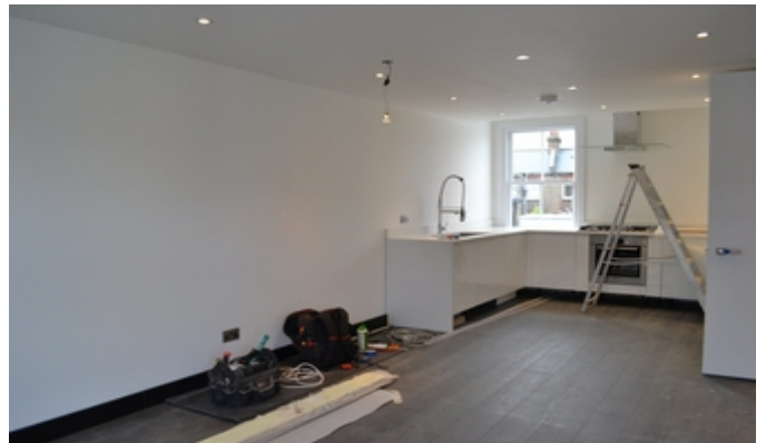
Kitchen Aspect 2