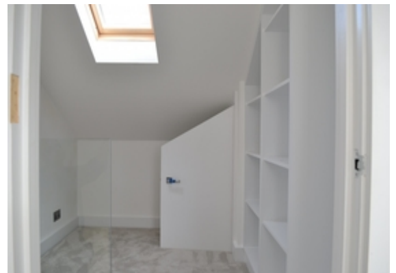
Loft Room Storage