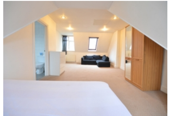
Bedroom 1 alt