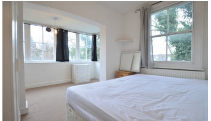
Bedroom 2 alt