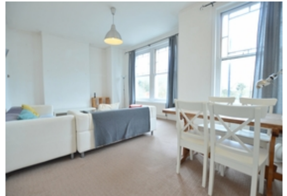
Dining Room alt