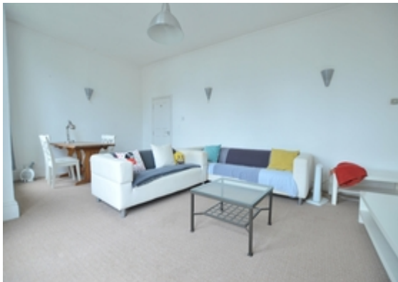
Dining Room alt