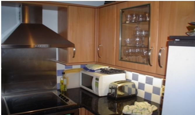
Kitchen (Other view)