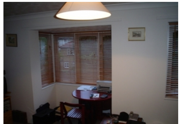
Second view of sitting room