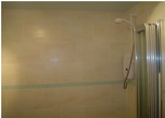
Shower view of bathroom