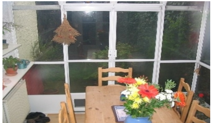
Horn Lane Conservatory