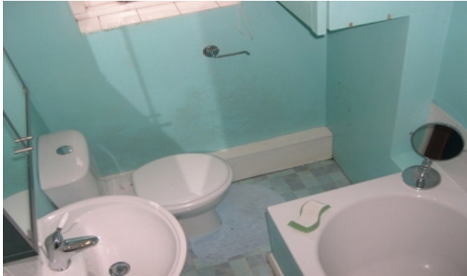
Horn Lane Bathroom