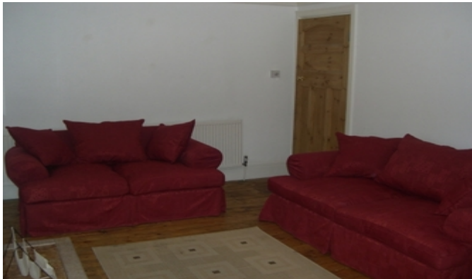
Horn Lane Lounge