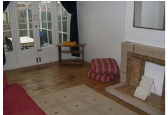
Horn Lane Lounge