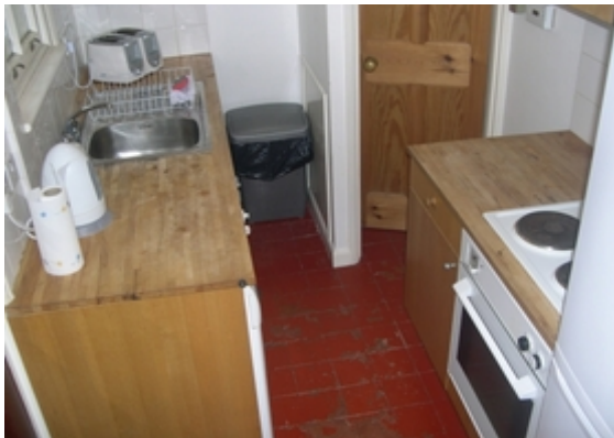
Horn Lane Kitchen