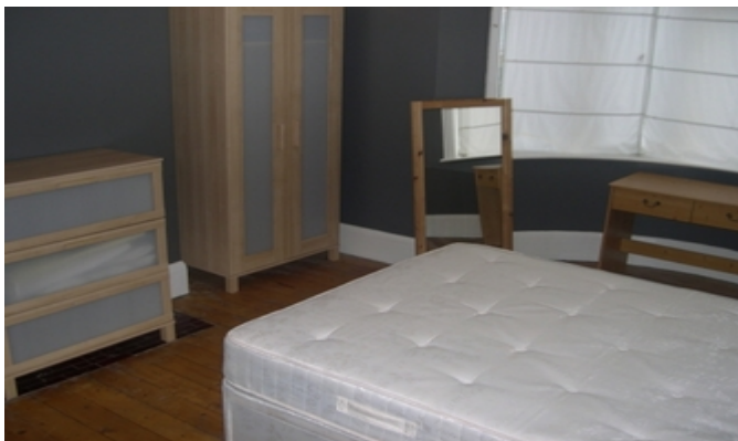
Horn Lane Bedroom