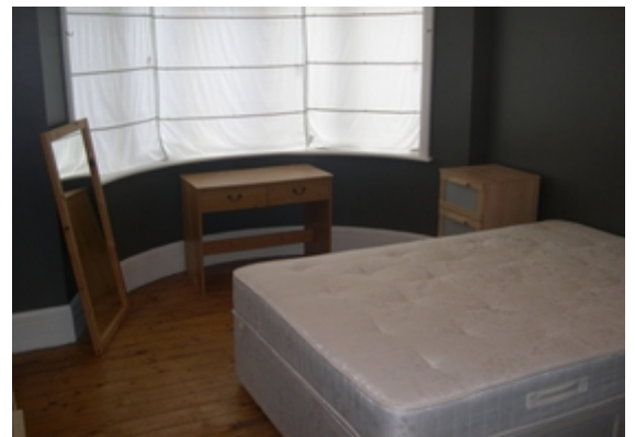
Horn Lane Bedroom