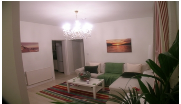
Lounge 2nd aspect