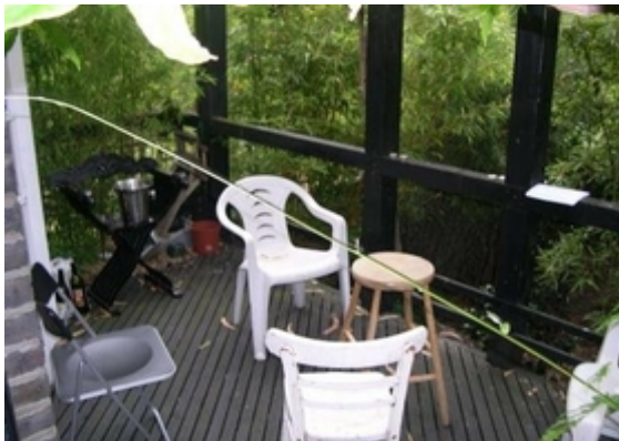
Decking from Kitchen